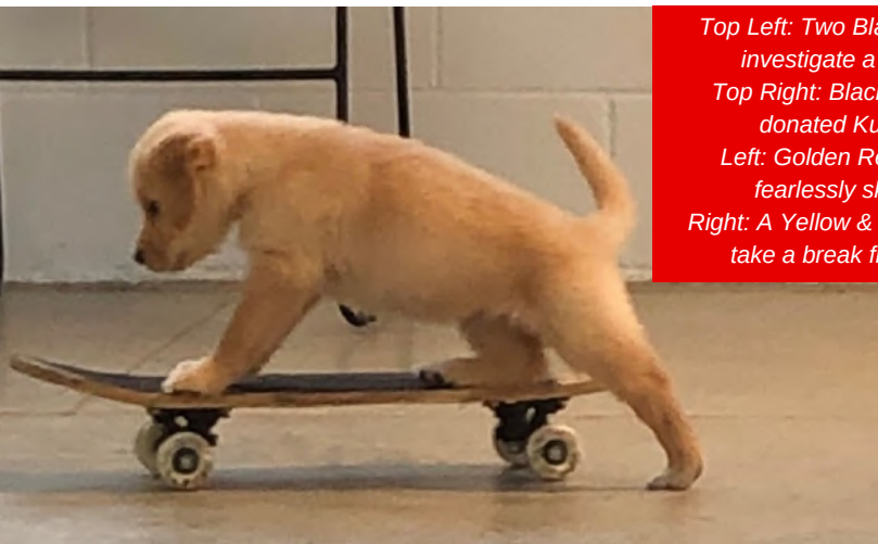
Top Left: Two Black Lab puppies investigate a teeter-totter Top Right: Black lab lying on a donated Kuranda Cot Left: Golden Retriever puppy fearlessly skateboards Right: A Yellow & Black Lab Puppy take a break from the party

It's a "ruff life" for these pups. They're destined to do great things with the support of their community, helping them every step of the way closer to Four Paws, Two Feet, One Team.