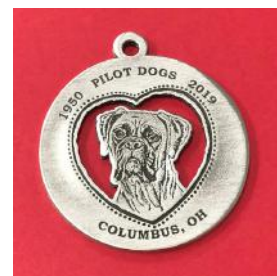
Top Left: Bryce attempting to make a blindfold putt Top Right: 19 golf groups ready to go in their golf carts Above: Both sides of the 2019 Boxer Ornament