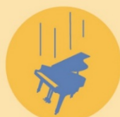
Flying or falling objects